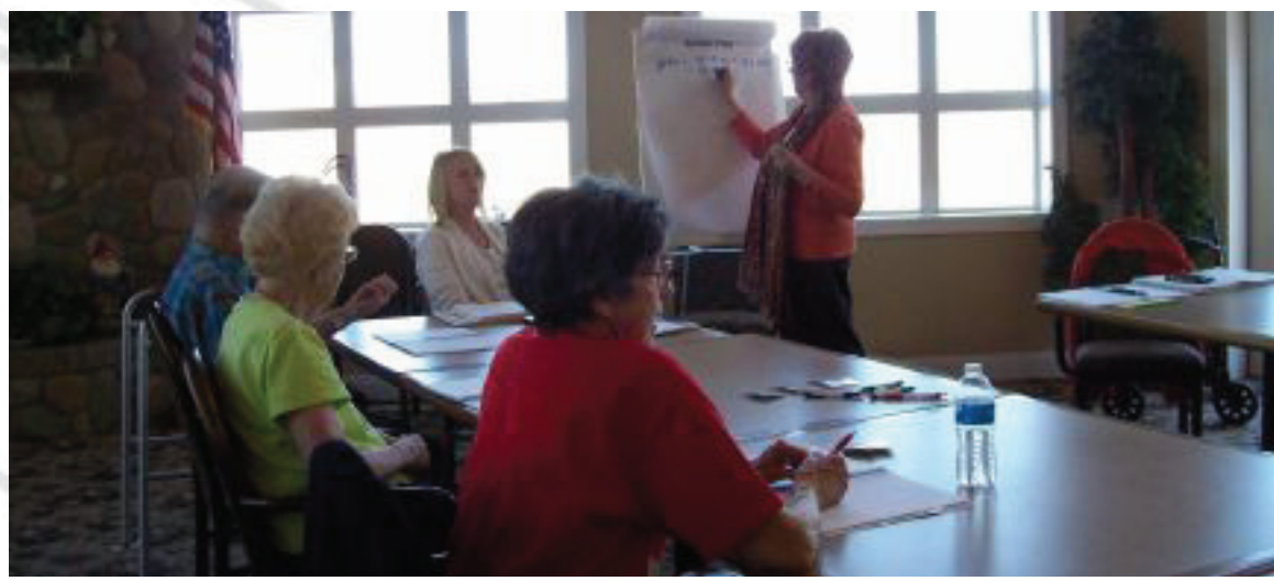
Thank you to the leaders and residents who made the Matter of Balance classes a success.